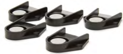
HI920005 Tag holders with tags (5)